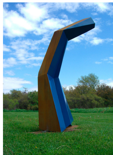
Untitled #191 (2008) Welded sheet steel (painted)