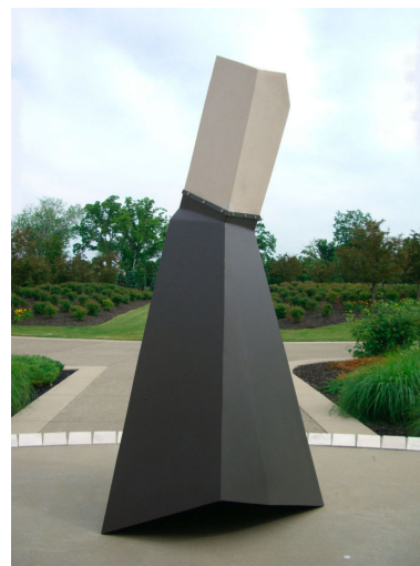
Untitled #168 (2007) Welded sheet steel (painted) & concrete