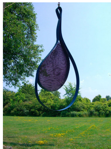
Untitled #203 (2008) Welded steel (painted) & plastic mesh