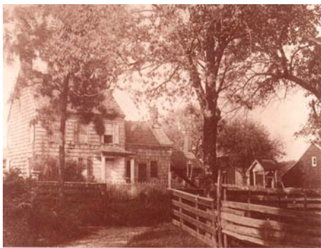
Walt Whitman Birthplace in 1903.