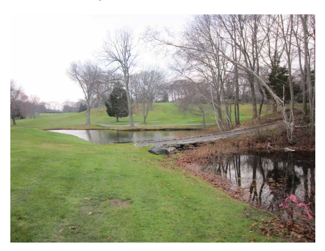
8: Looking southwest at golf course cart path and pond intersection.