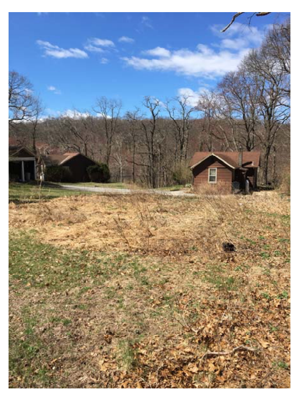
31: View looking west within tax parcel 3.3, towards existing structures proposed for removal, near Lee's Court western entrance from Makamah Road.