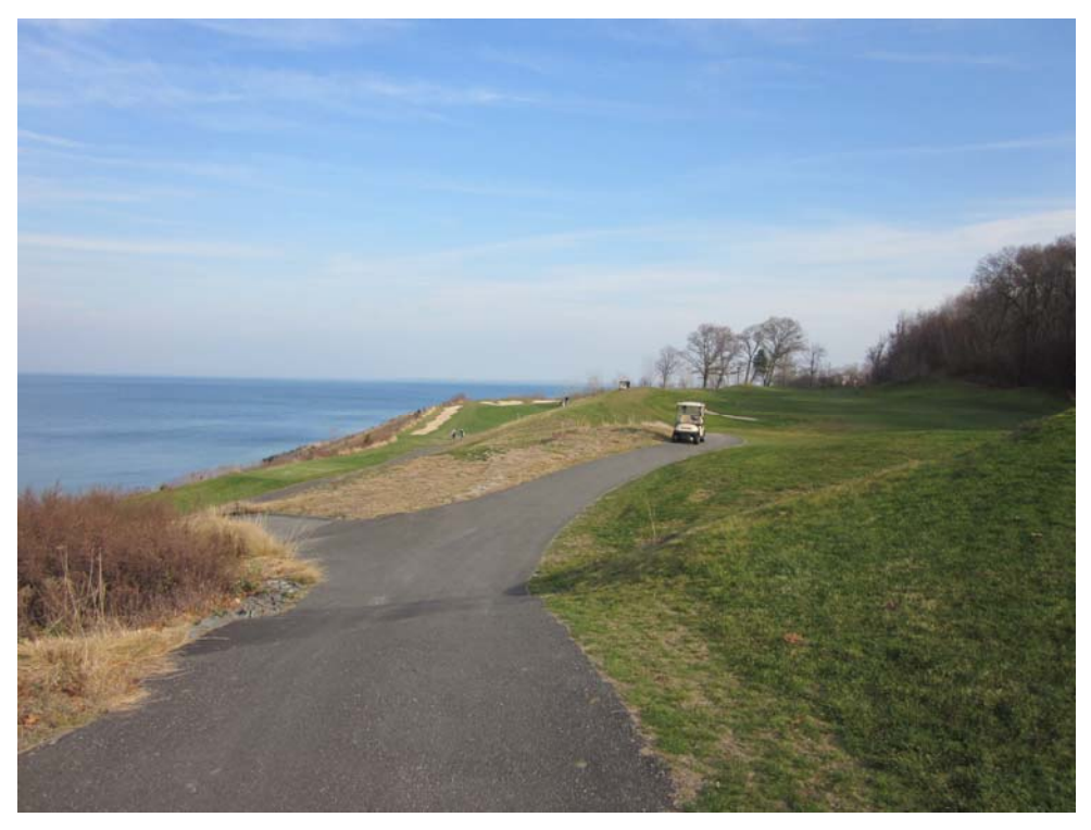
3: Looking east along Fairway 12. Long Island Sound in background.