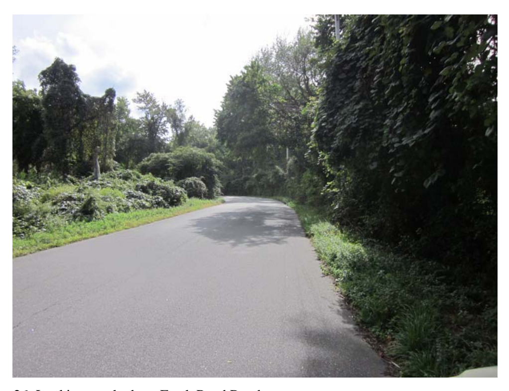
26: Looking south along Fresh Pond Road.