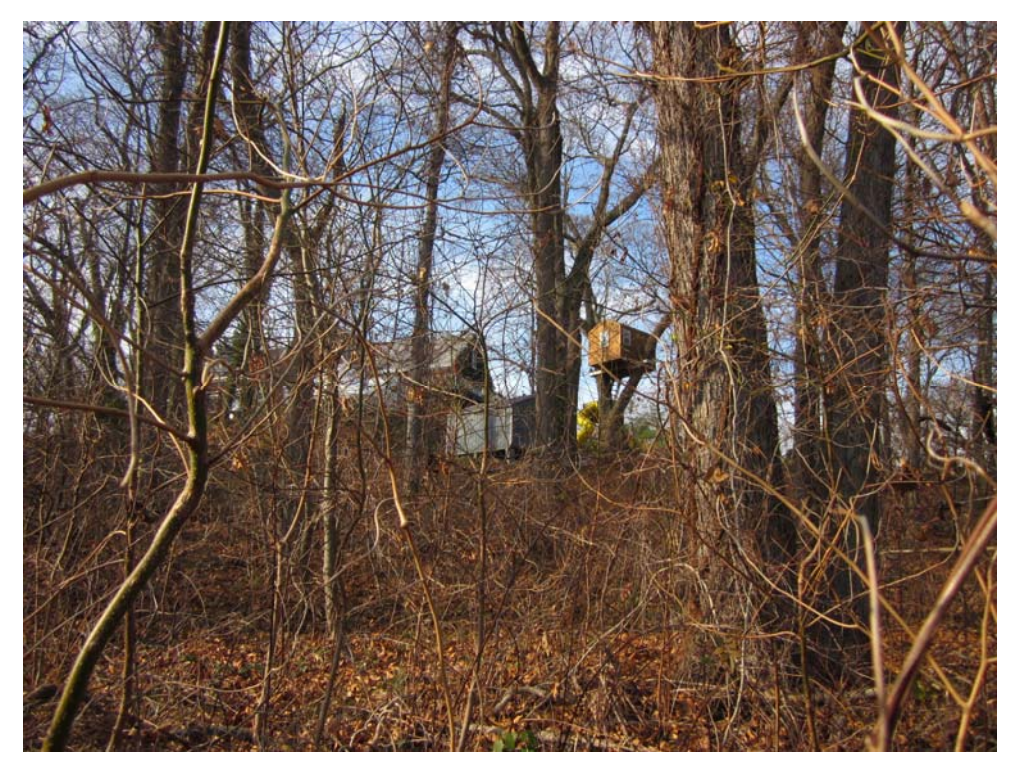
5: View of home on Hayes Hill Drive from golf course trail.