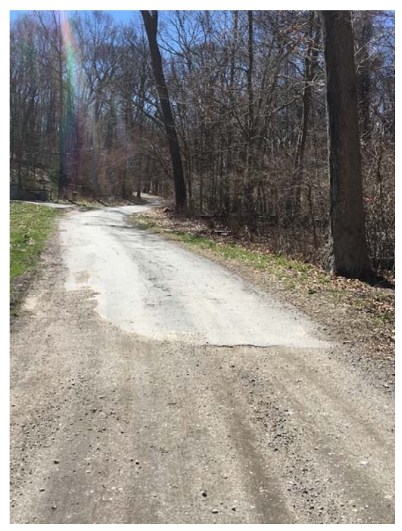
29: View of private right-of-way off Makamah Rd., looking south towards east entrance of proposed Lee's Court.