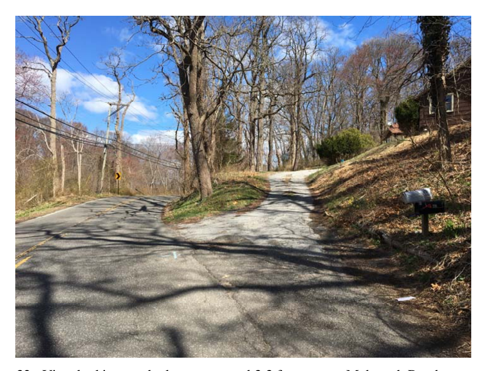
32: View looking north along tax parcel 3.3 frontage on Makamah Road.