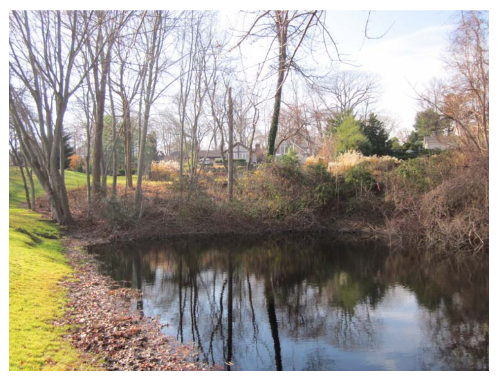
7: View of home on Hayes Hill Drive.