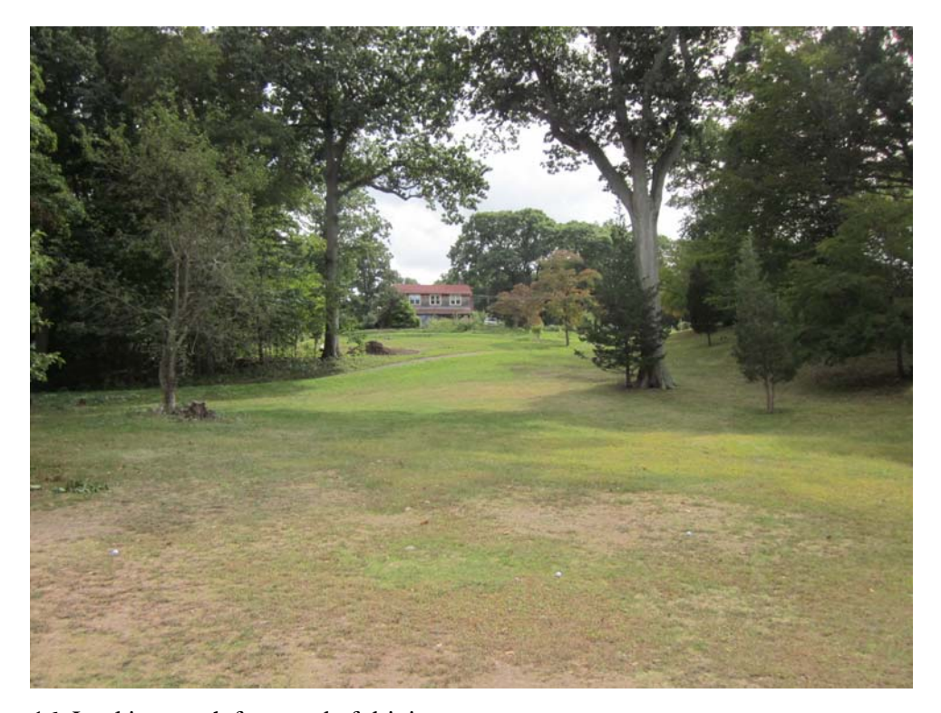
16: Looking south from end of driving range.