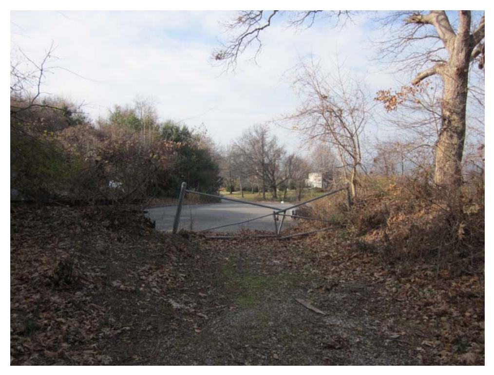
4. Looking west into tap end of Mystic Lane.