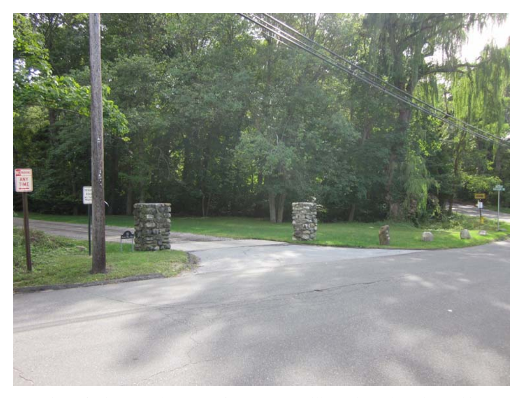
27: View of private road entrance from Breeze Hill Road. Makamah Road intersection in background