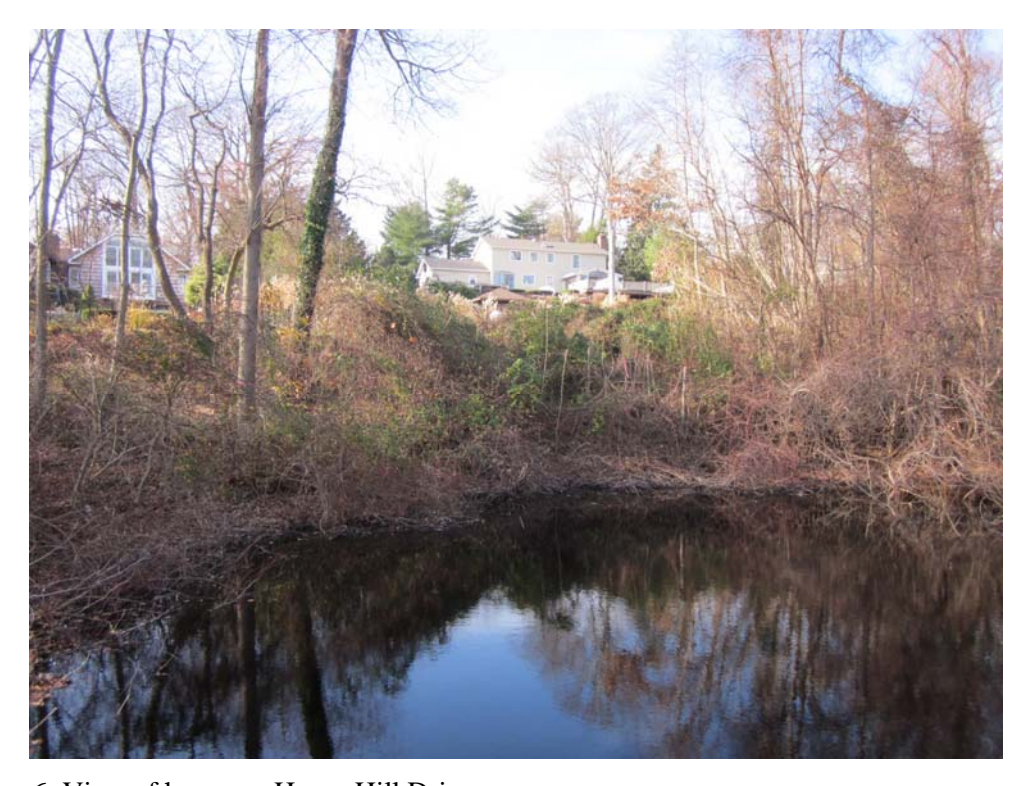
6: View of home on Hayes Hill Drive.