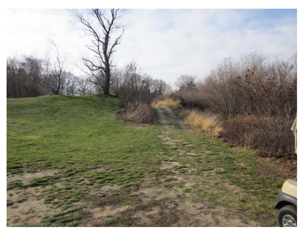
13: Looking west towards Mystic Lane.