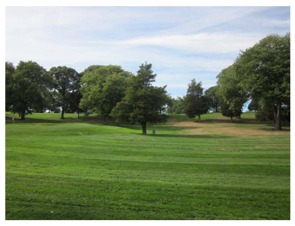
23: Fairway area west of Fresh Pond Road.