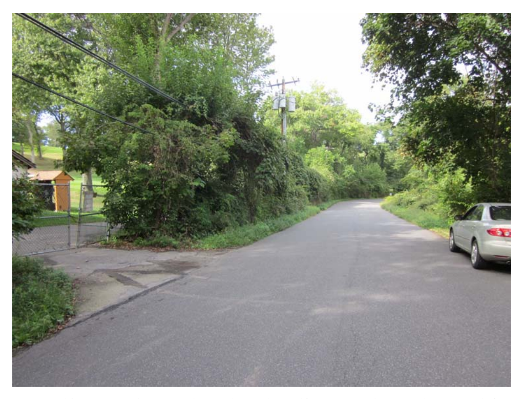
25: Looking north along Fresh Pond Road. Golf course well pump house on left.