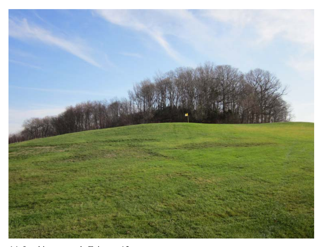
14: Looking towards Fairway 13.