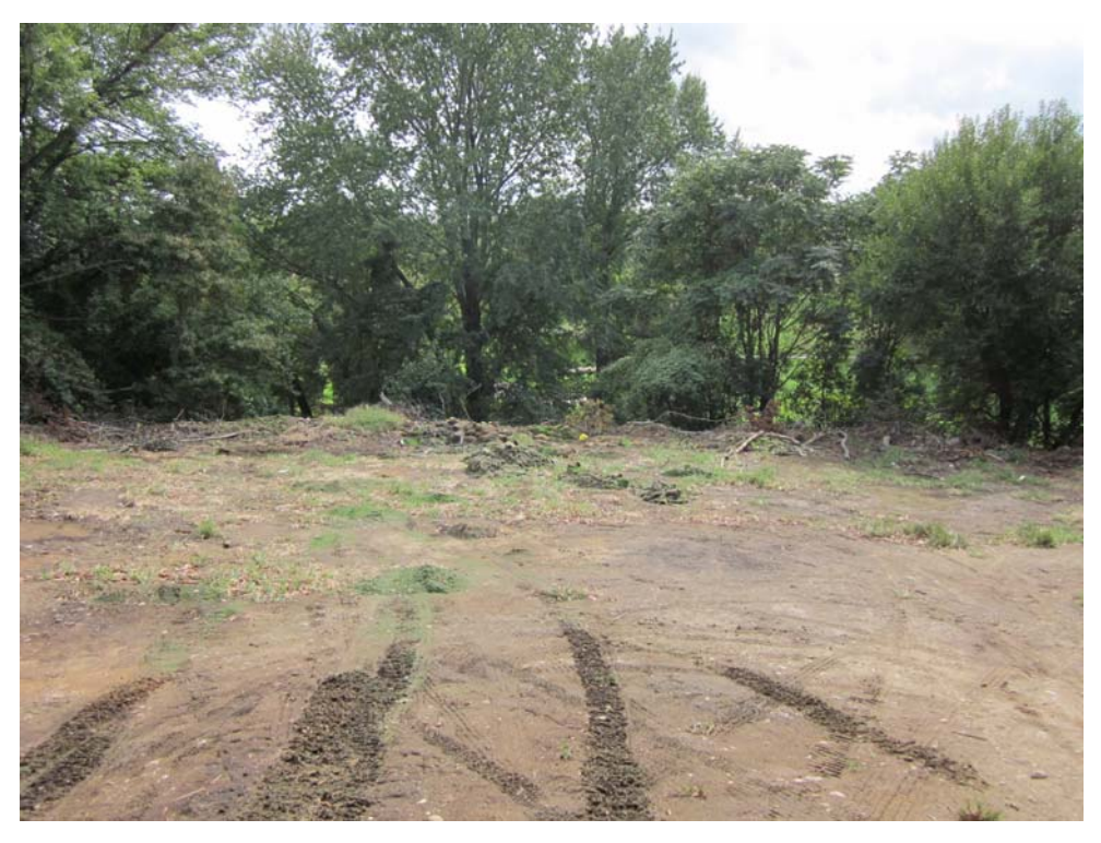
21: Disturbed area west of Fairway 2