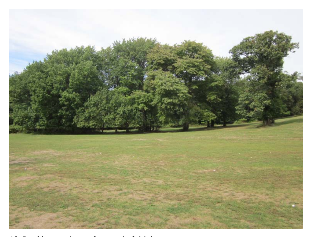
18: Looking northwest from end of driving range.