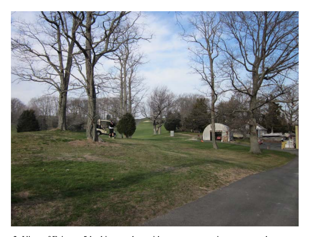
2: View of Fairway 5 looking north outside entrance to maintenance yard.