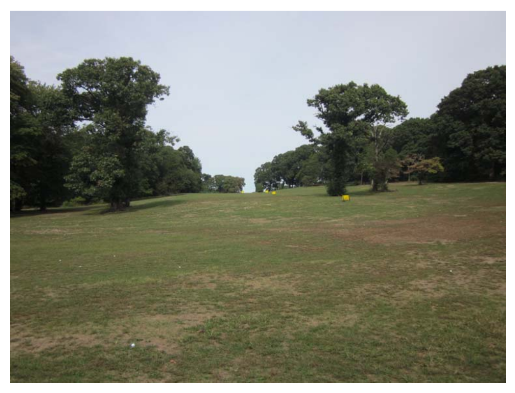
19: Looking north to top of driving range.