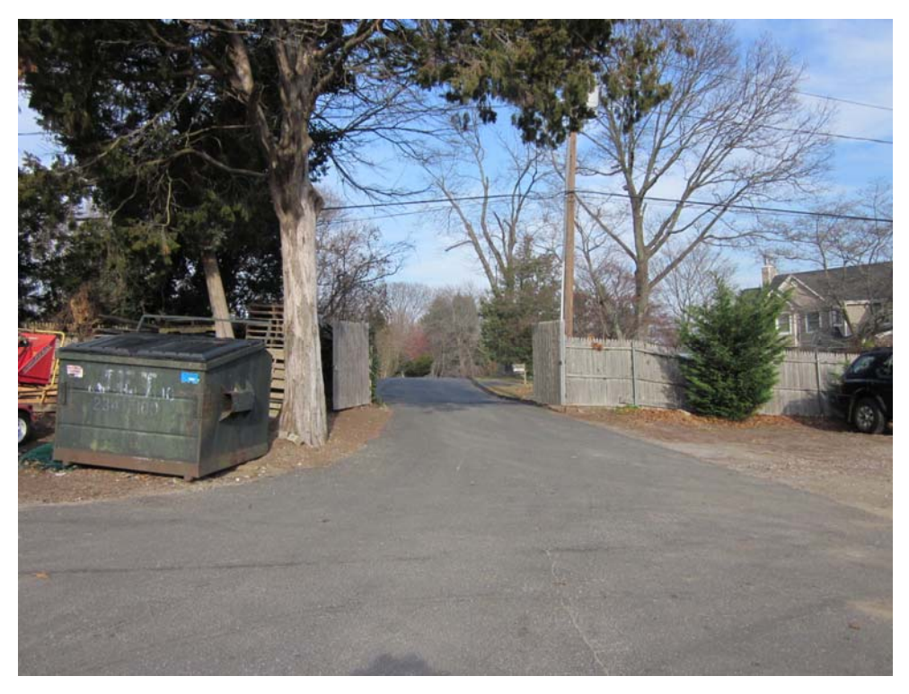
1: View from golf course maintenance yard to Thornton Drive.