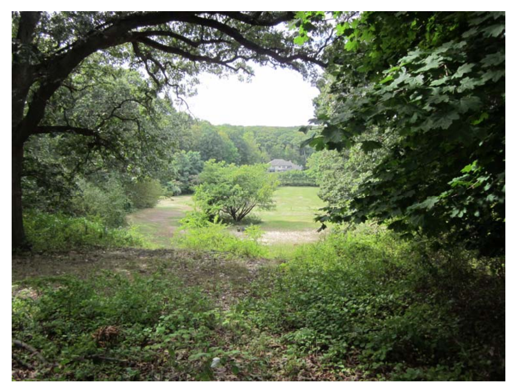
15: Looking west to southern end of driving range.