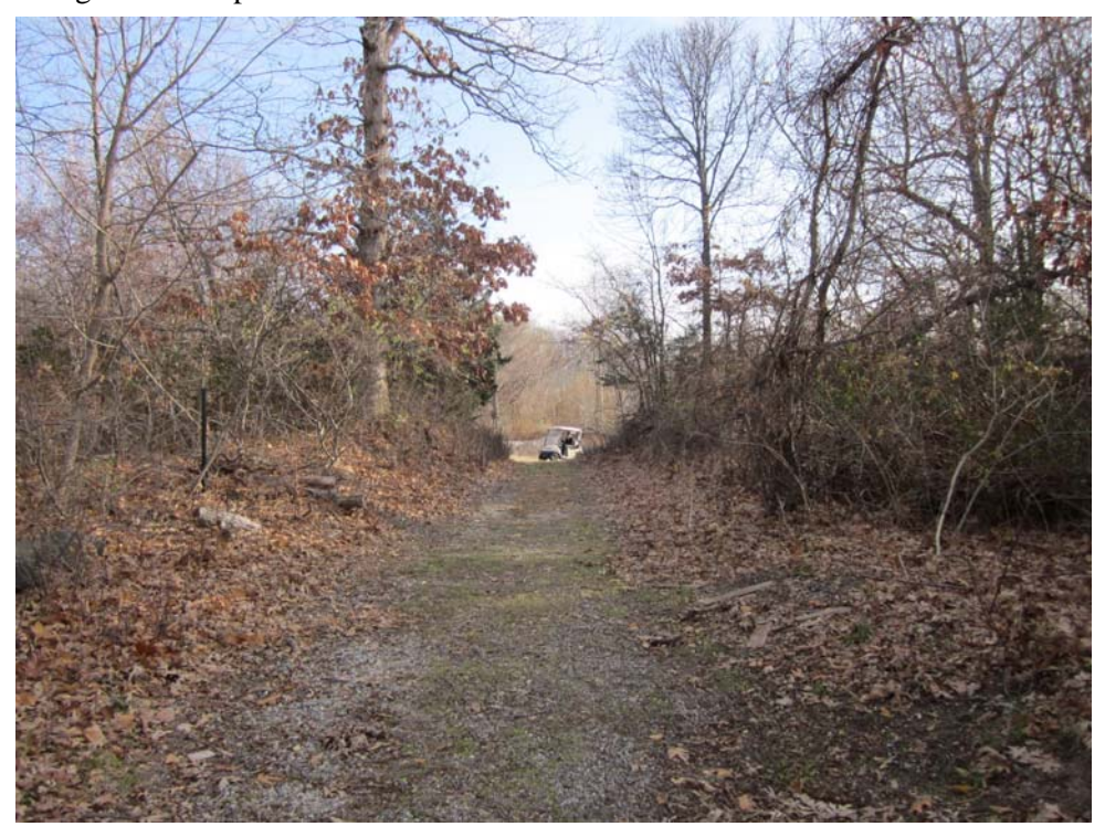
12: Looking north along golf course trail