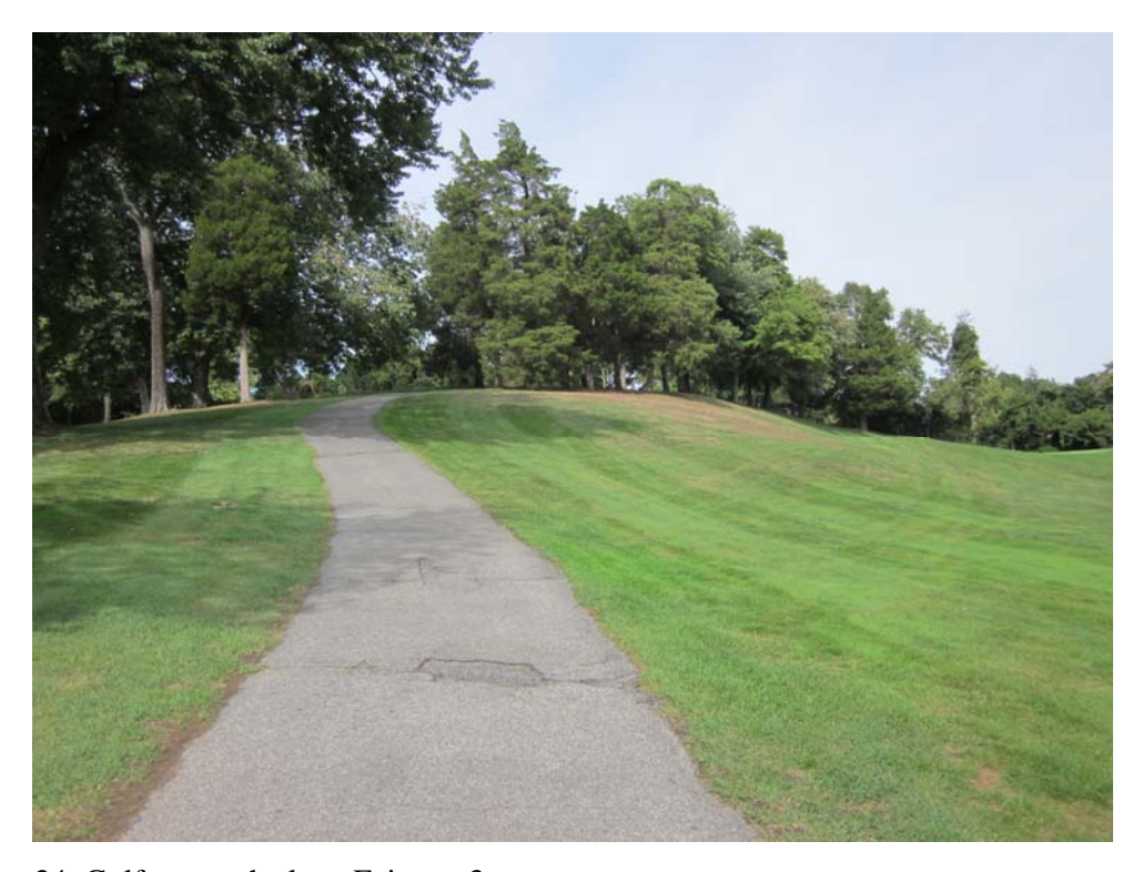
24: Golf cart path along Fairway 3