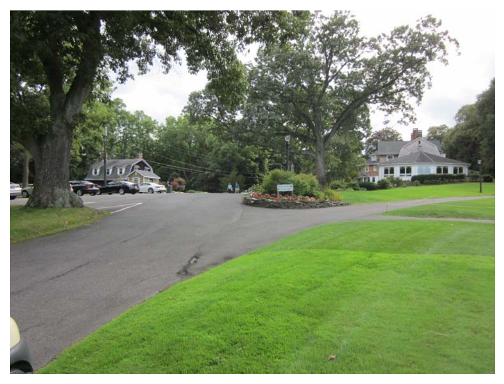
9: Looking south towards clubhouse (right-side) and golf cart barn (left side)