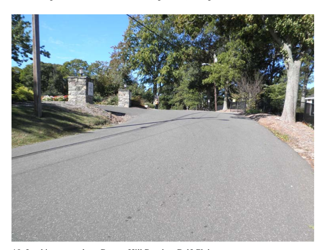
10: Looking west along Breeze Hill Road to Golf Club entrance.