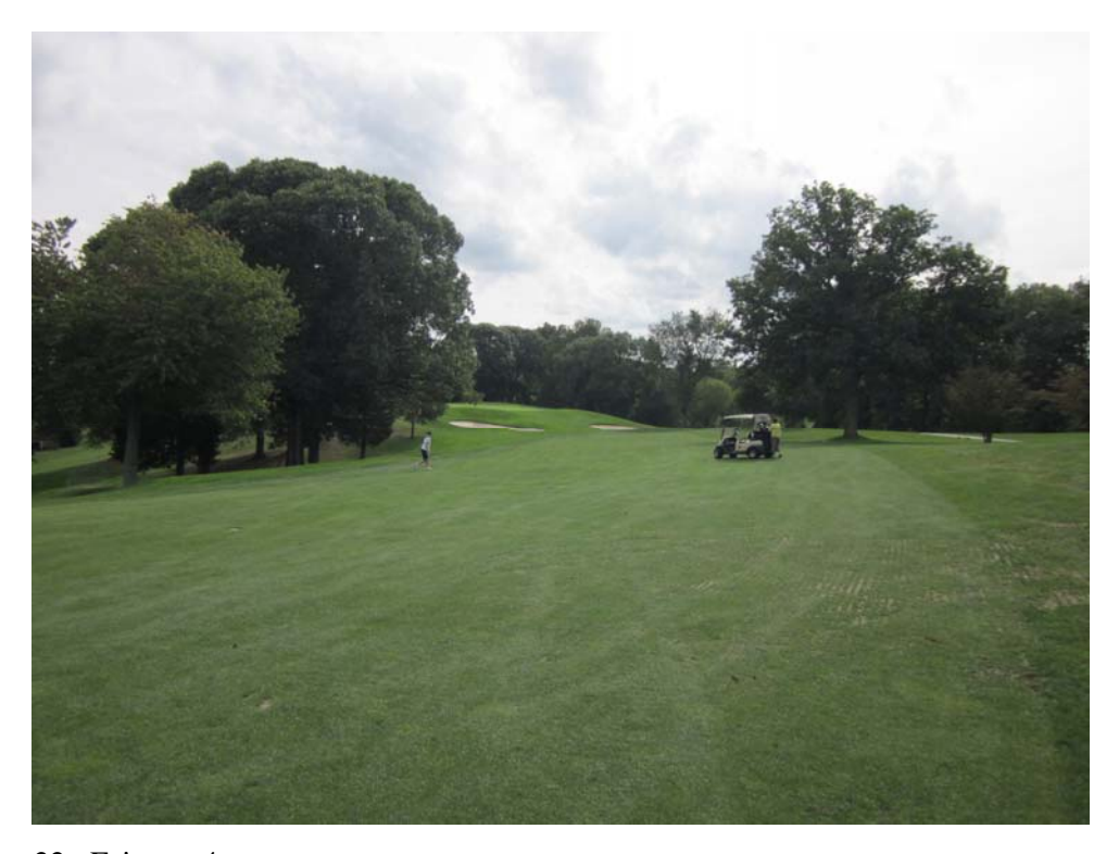
22. Fairway 4