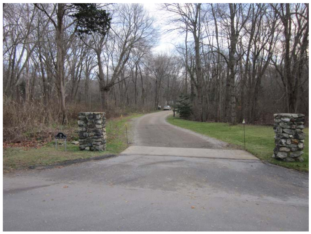
28: Private road entrance from Breeze Hill Road.