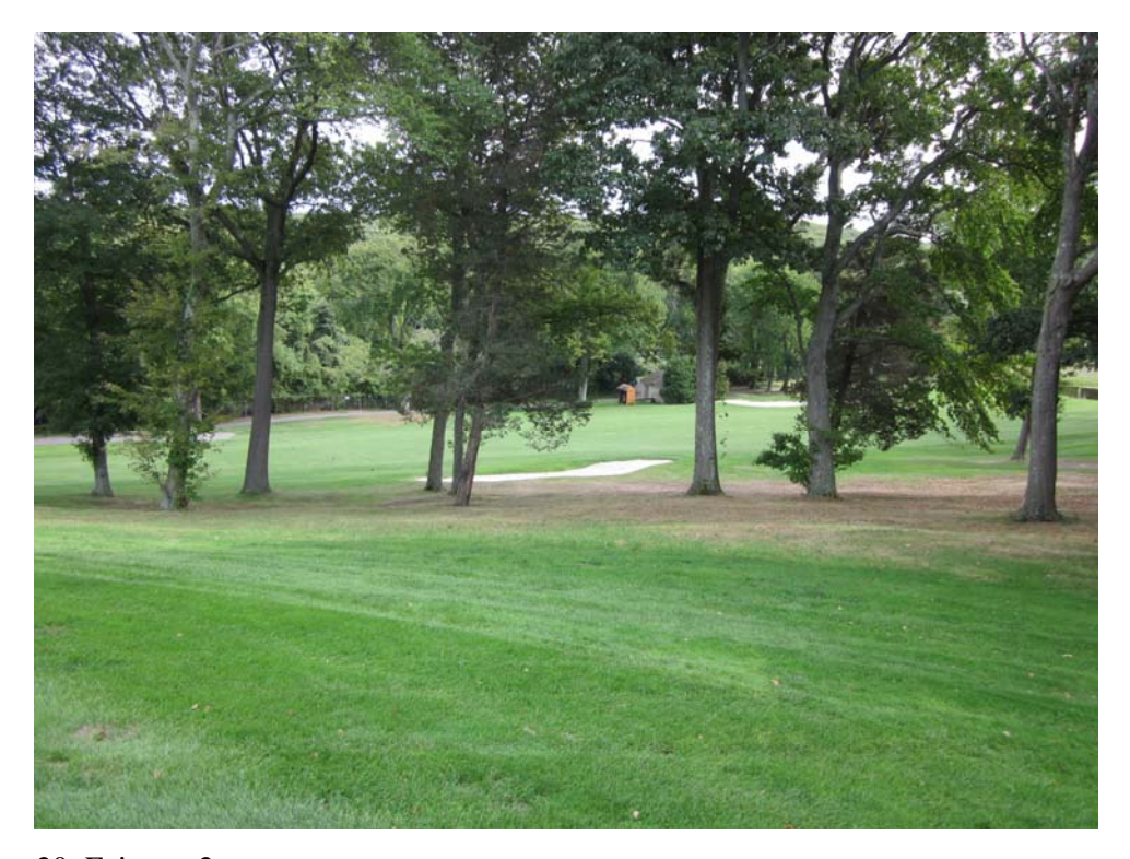
20: Fairway 2