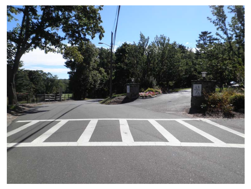
11{:}\ Looking east along Breeze Hill Road to Golf Club entrance. Crosswalk in foreground/cart path