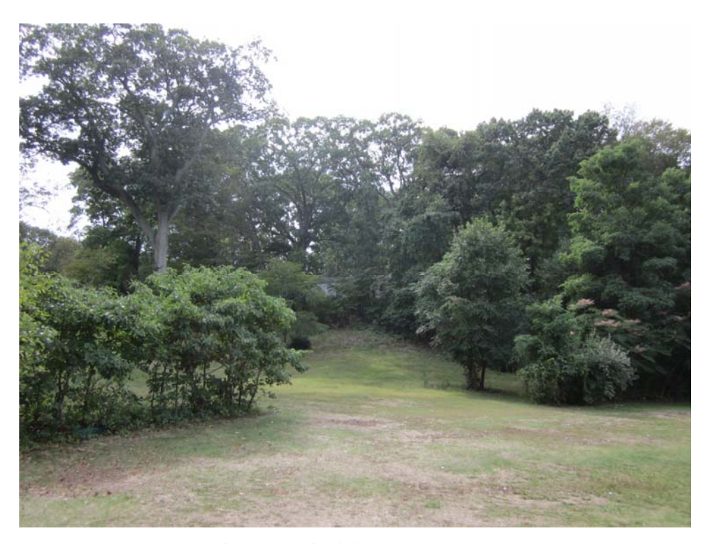
17: Looking southwest from end of driving range.