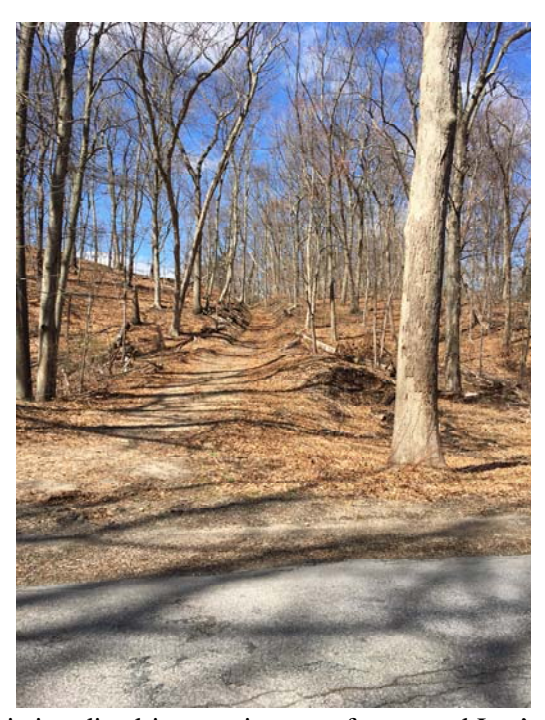
30: View of existing dirt driveway in area of proposed Lee's Court east en-